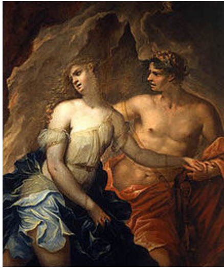
Don Giovanni by W.A. Mozart