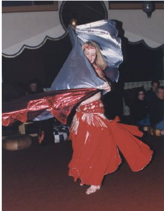
Dr. Atomic by John Adams