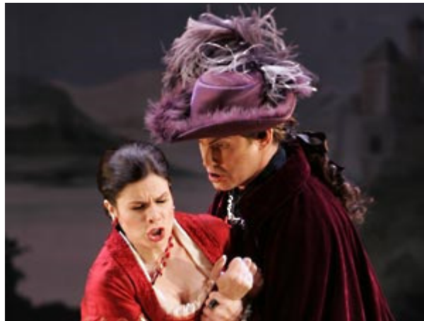
Rigoletto by Giuseppe Verdi